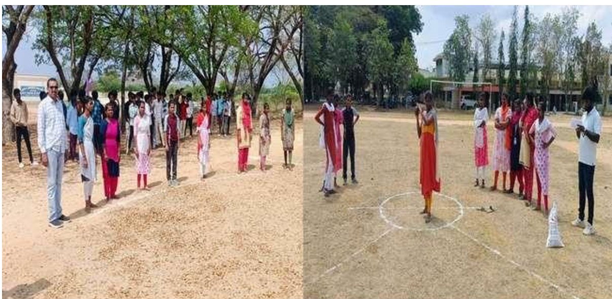
Girl Students participated in Games and Sports actively