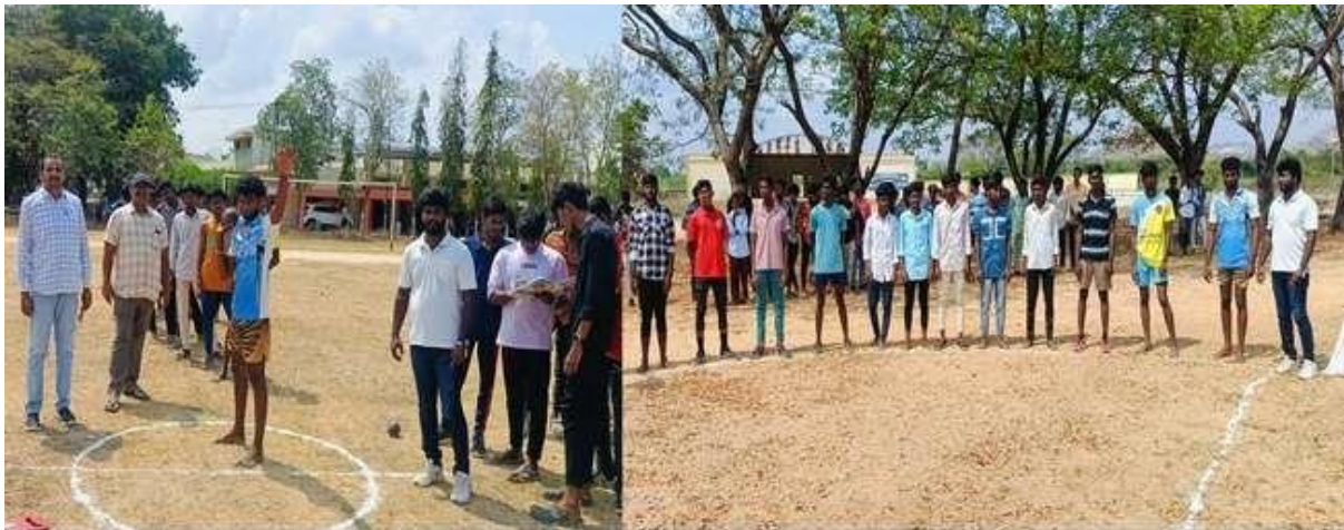
Students participated in Games and Sports enthusiastically